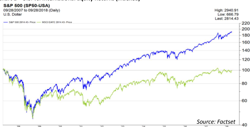
Chart 1—U.S. vs. International Equity Returns (Indexed)

Despite the performance results of the domestic benchmark far exceeding those of its international counterpart, the performance of Dividend Growth stocks has been comparable regardless of geography. Domestic Dividend Growers have posted a 12.8% annualized re-